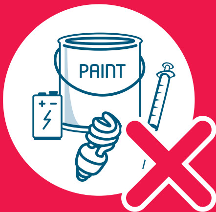
Hazardous & medical waste