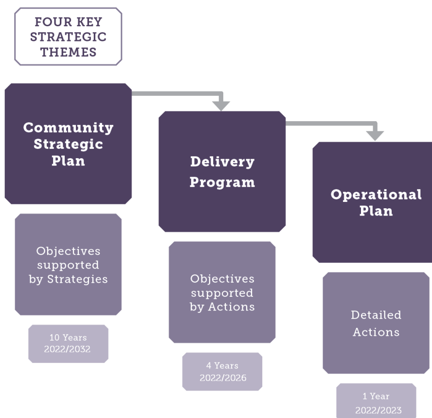
Figure: Integrated Planning and Reporting Elements

Specific actions to be completed and the resources required for each financial year are explored further in Council's Operational Plan and Resourcing Strategy. The relationship between the Community Strategic Plan, Delivery Program and Operational Plan is demonstrated in the following figure.