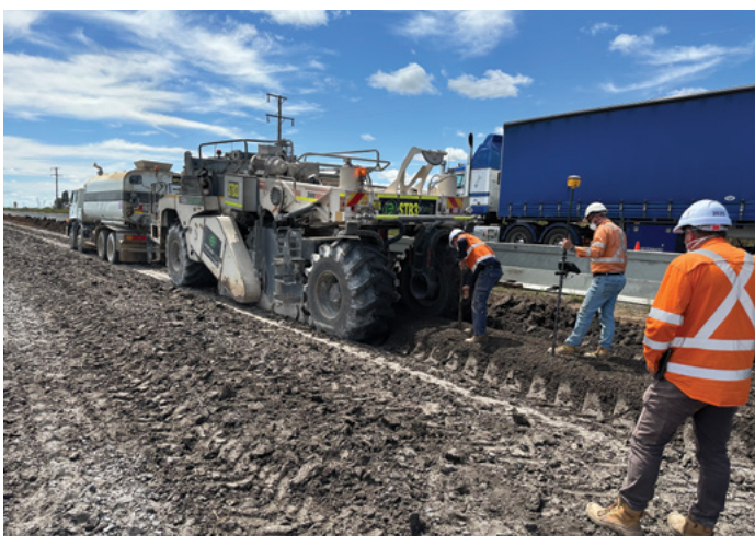
Lime stabilisation of the new highway base in Section 5 south of Moree

2.4m total spend on Aboriginal businesses (8.24% of total eligible spend)