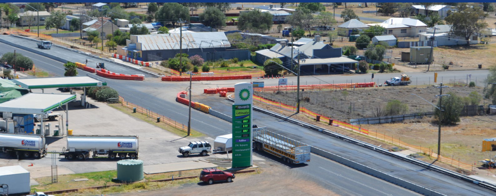
New pavement works in Bellata

The Australian and NSW Governments are jointly funding the $261.17 million Newell Highway heavy duty pavement upgrades between Narrabri and Moree. These upgrades will improve safety for motorists and reduce future maintenance requirements and costs.