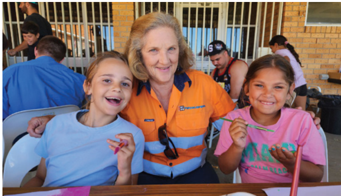
Local kids and Fulton Hogan staff, enjoying the local Aboriginal painting masterclass