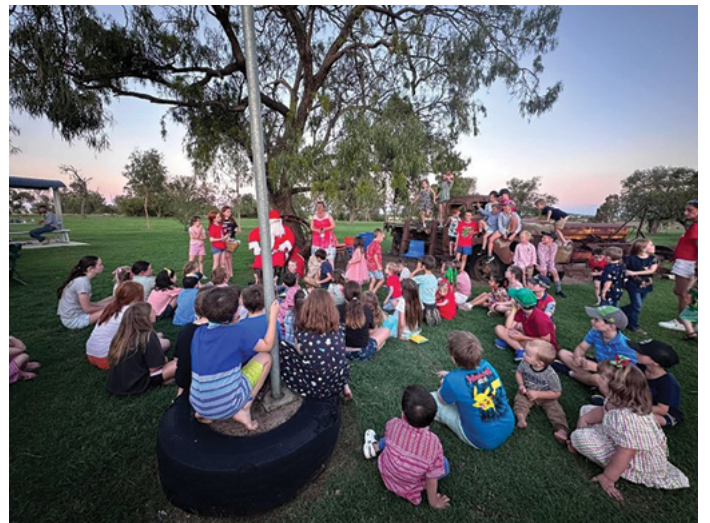
Bellata local kids receiving gifts from Santa